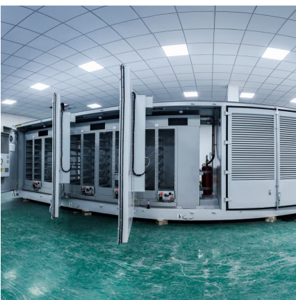
Photo-charging sodium-ion battery by gallium arsenide solar cell

Herein, we report a photo-chargeable sodium-ion battery (PC-SIB) that leverages a self-designed multi-functional modulator to directly charge sodium-ion battery ...