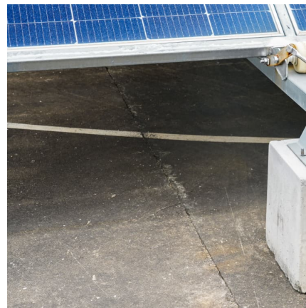
ABB central inverters PVS800 - 500 to 1000

From Nassau to the Family Islands, we supply premium solar panels, inverters, and batteries to installers across New Providence, Grand Bahama, Abaco, Eleuthera, and beyond.